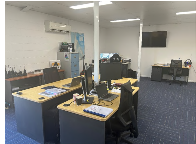
Newest QRIC Regional Hub in Cairns. QRIC converted the disused Cairns Greyhound Club Kennel Block into usable office and meeting space.

Hubs will continue to grow as the Club provided race day integrity roles continue the transition to QRIC.